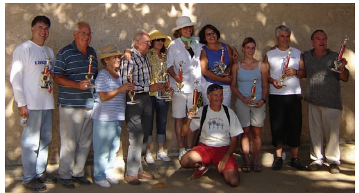
It's great fun to play but more fun to win. Pictured are the major trophy winners from the Rudi Hertig Panache Tournament held August 26. Below, views from the day. More photos on page two.