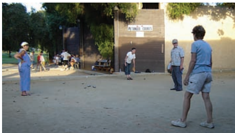
A beautiful morning for pétanque...before a sweltering day to come.