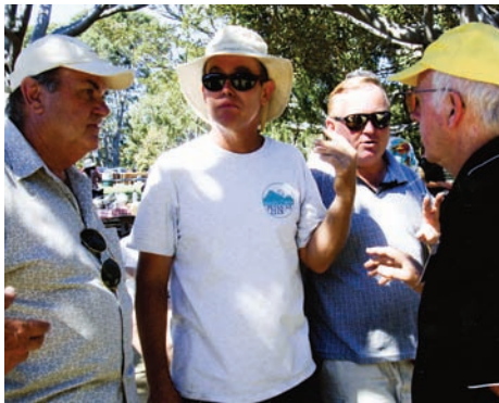
Umpires and players debate an issue during the FPUSA Tête-à-Tête National Championship.